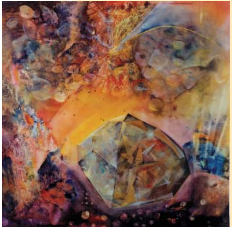
Above: And You Shall Have Jewels To Walk Upon