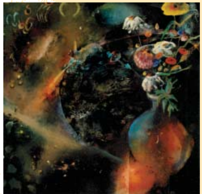
Right: If Supported by Observation, a Theory is Only Temporarily True